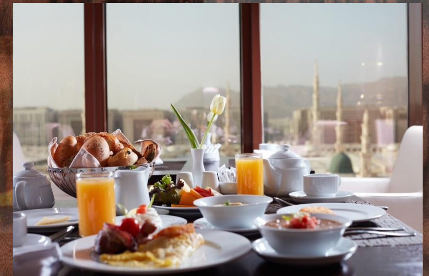
A TREAT FOR TASTE-BUDS & SOUL