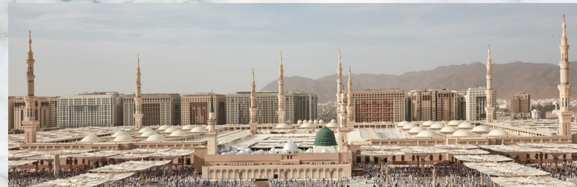
IMMERSE IN SPIRITUAL SETTING LIKE NEVER BEFORE