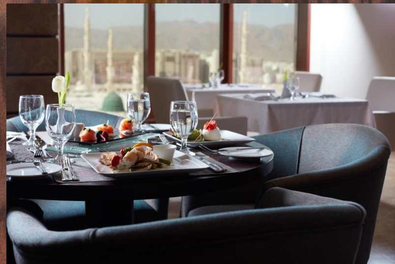
IDEAL FOR BUSINESS & LEISURE