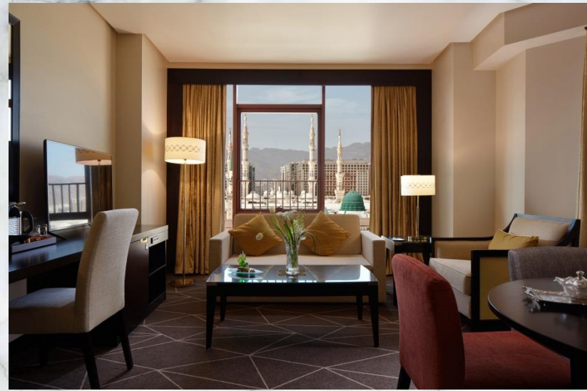
LEAVE THE MATERIAL WORLD BEHIND