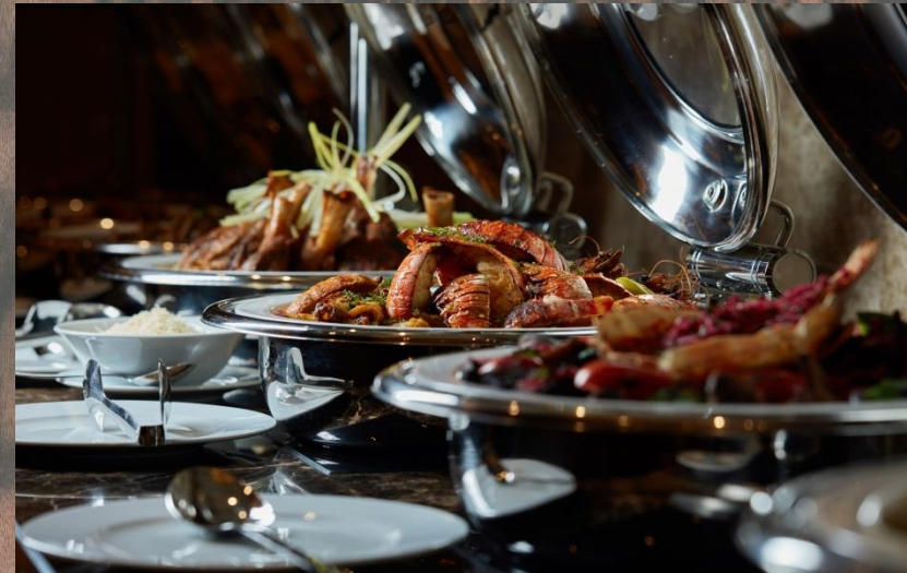
AN AFFAIR OF ALL DAY DINNING

A choice of four International Restaurants, and a lobby café enable our nomads to taste the best of handpicked International cuisine experience.