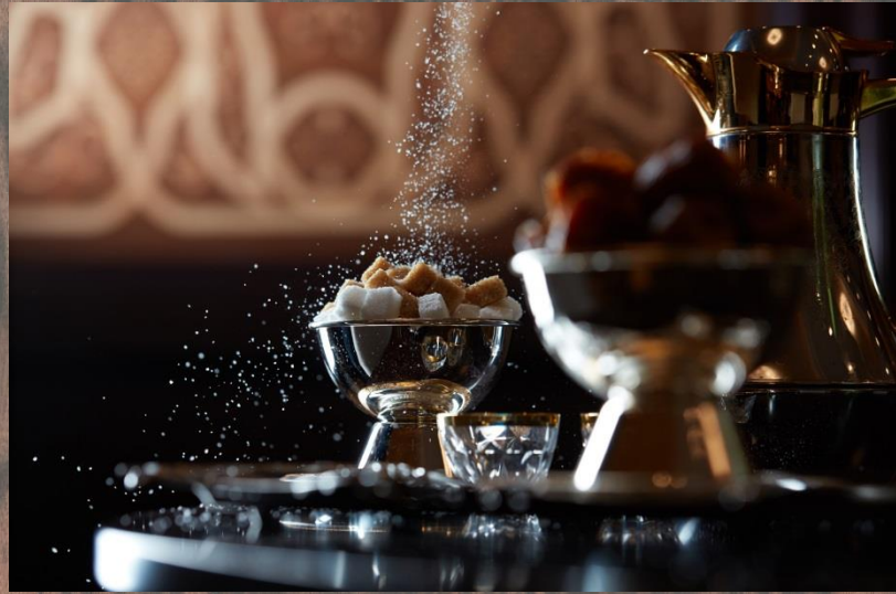
FLAIR OF DATES, COFFEE AND MUCH MORE