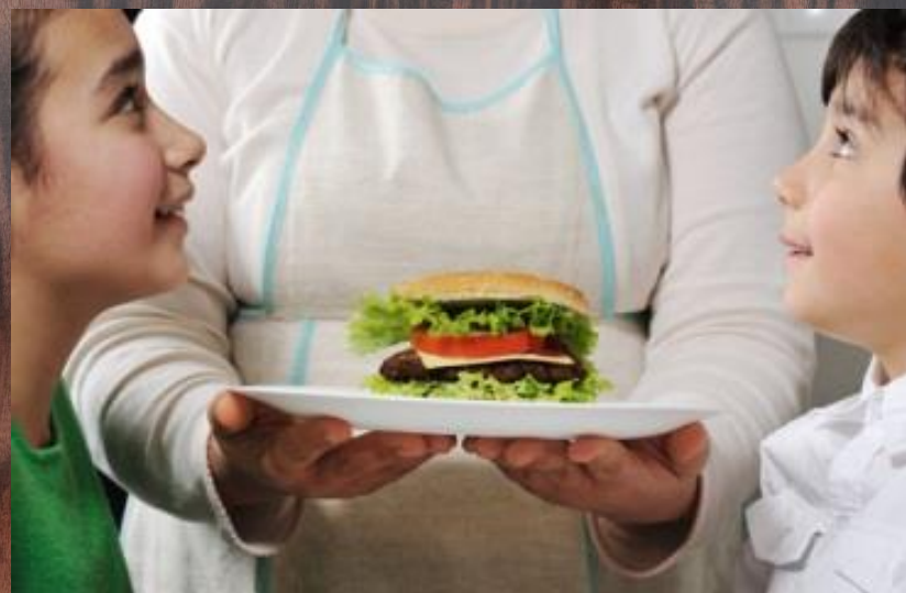
SPECIAL KIDS MENU AVAILABLE

A choice of four International Restaurants, and a lobby café enable our nomads to taste the best of handpicked International cuisine experience.