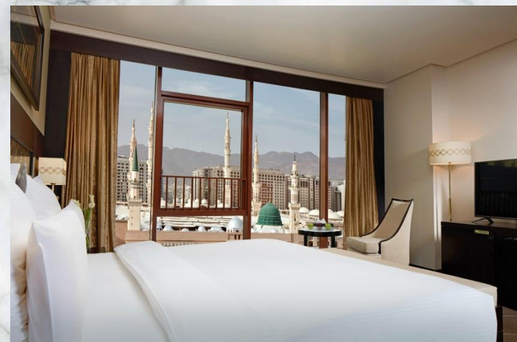
COMFORT YOUR EYES & SOUL