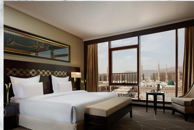
A SPIRITUAL RETREAT LIKE NO OTHER